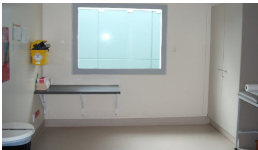
Some Health Centres have treatment rooms that are not dissimilar to those found in modern General Practice facilities.