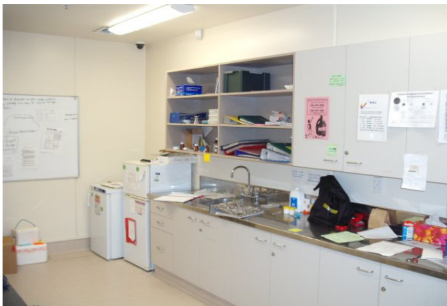
Inside the medication room at a newer Health Centre. The fridges on the left are used to store some types of medication.