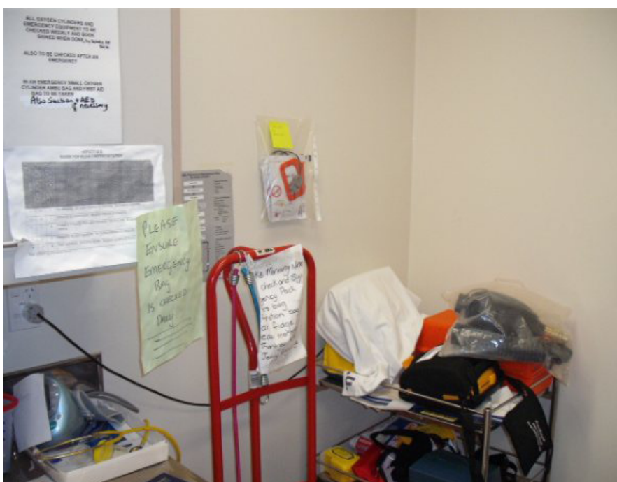
Emergency equipment is carried on a trolley for ease of transport. Random checks at two other prisons showed that the required checklist of equipment was not up-to-date.