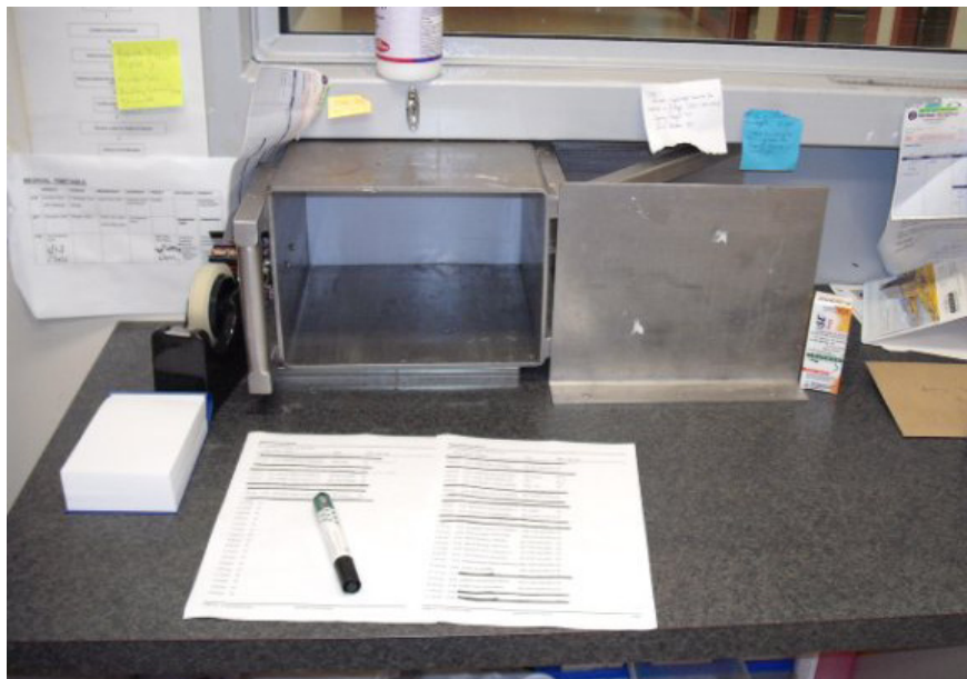
Prisoners receive methadone through the metal device shown in the photograph.