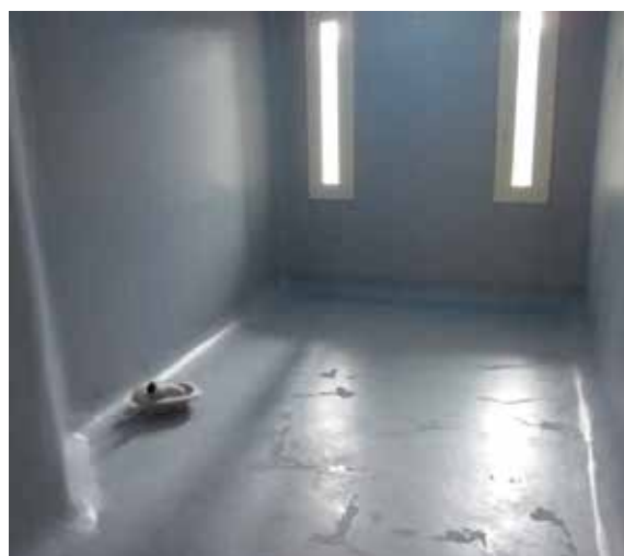
Round room at Mt Eden Corrections Facility.

Some prisoners considered to be at risk of harm to themselves may be required to wear anti-rip clothing and are then placed in the “round room” which is a bare cell (see photo). The round room also contains a mattress and an anti-rip blanket (which were being cleaned at the time this photo was taken). The purpose of placing someone in these conditions is to prevent incidents of suicide or self-harm.