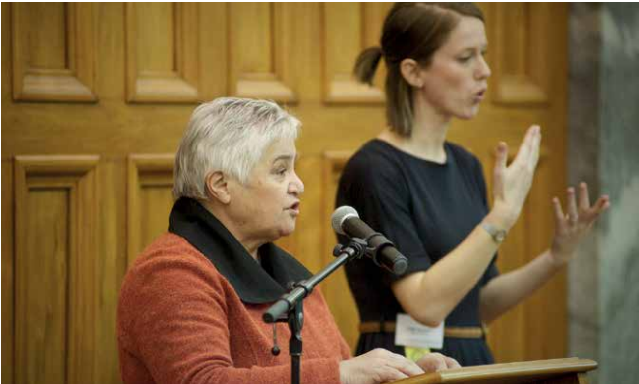
The Hon. Tariana Turia.